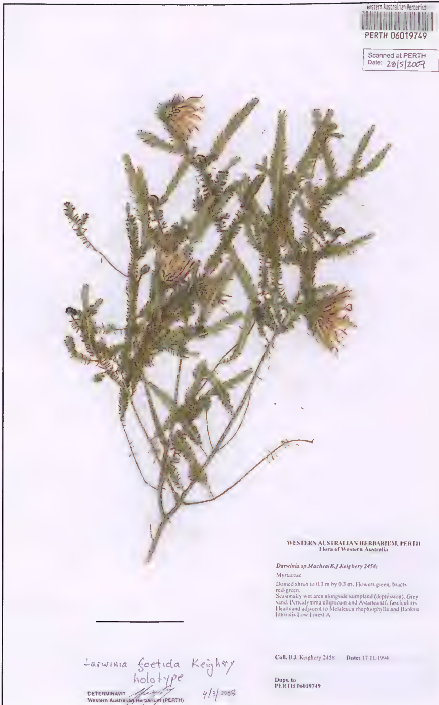
Figure 3. Holotype of Darwinia foetida , scale = 5 cm.